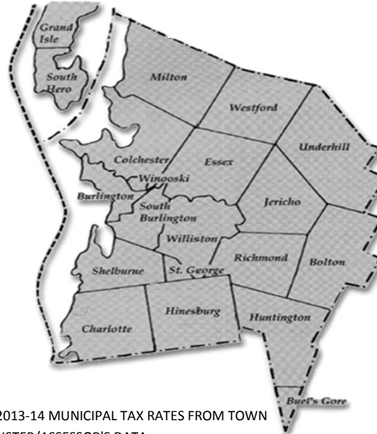
2013-14 MUNICIPAL TAX RATES FROM TOWN LISTER/ASSESSOR'S DATA